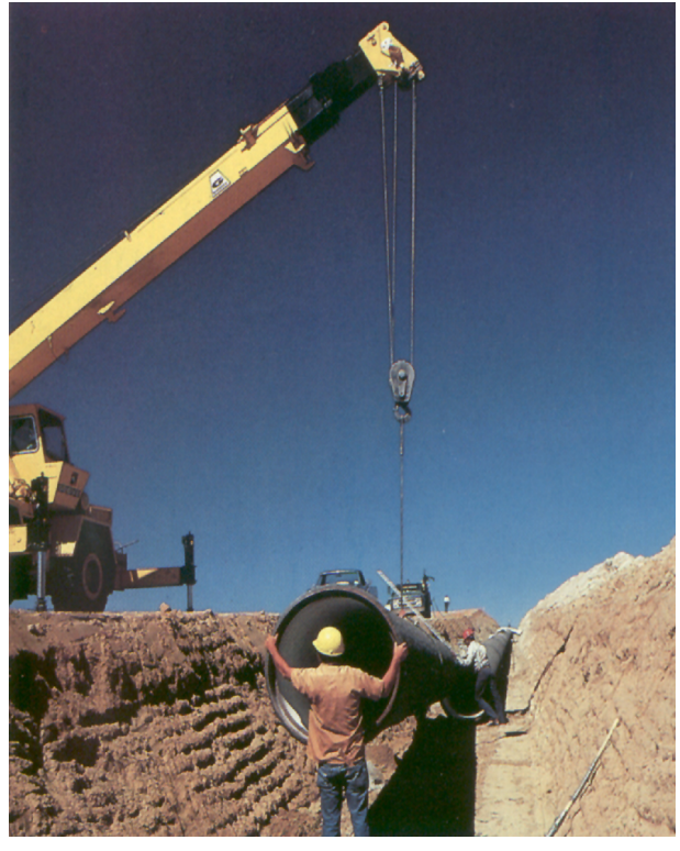
BJY provided Civil Engineering and Inspection Services for the City of Phoenix, Arizona.

California . BJY provides complete Structural, Fire and Life Safety, Accessibility, Energy Code, Mechanical, Plumbing and Electrical building inspection, code consulting and/or plan review for the