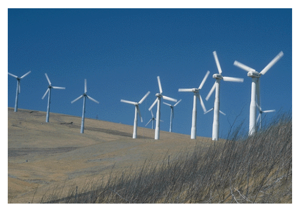
BJY provides building safety services for renewable energy projects.

GWF /Tracy Peaker Project, 169 mW, San Joaquin County, California – This is also a GWF Energy project, and BJY provided Chief Building Official, Plan Review and Inspection services. It includes the power plant, an onsite 230 kV switchyard, natural gas supply interconnection, five-mile 230 kV electric transmission line, 1,470-foot water supply pipeline, and improvements to an existing dirt access road approximately one mile in length.