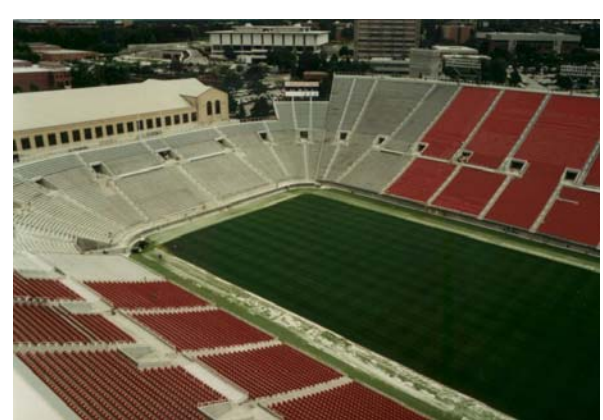
Rice-Eccles Stadium, Salt Lake City, Utah. BJY provided Plan Review and Inspection services for the $45 million renovation of this site for the 2002 Winter Games Opening and Closing Ceremonies.

BJY will review plan submittals in accordance with the Building Official directives, adopted codes, LORS and amendments of the jurisdiction.