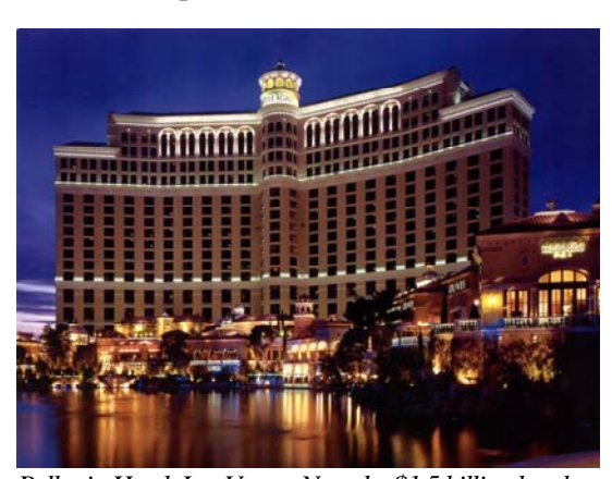
Bellagio Hotel, Las Vegas, Nevada, $1.5 billion hotel.

and Electrical reviews on commercial projects. Sample projects include concrete tilt-up, a large hotel, a senior housing facility, office buildings, a pedestrian walkway and the Northern Air Cargo expansion. BJY staff has performed reviews of many other Anchorage facilities under previous contracts.