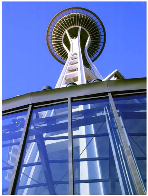
Space Needle, Seattle, Washington. BJY provided Plan Review for the $885,000 renovation of this historic landmark. This remodel added an additional story, a basement and restaurants.

BJY is highly cognizant of the importance of maintaining timely turnaround periods, and has a full-time staff capable of satisfying this commitment. Our offices facilitate timely document transmission and archiving for the jurisdiction. Once notified by the jurisdiction, the plans will be shipped to our local office. We will provide all necessary shipping documents.