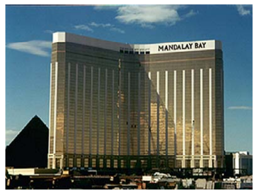
Mandalay Bay Hotel, Las Vegas, Nevada. BJY provided Plan Review Services for this $950 million project.

Our compensation for the initial plan review and