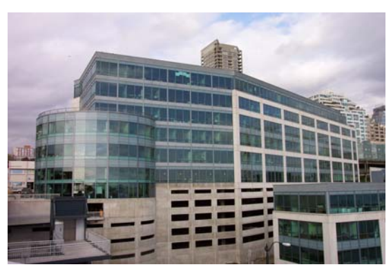
BJY provided Building Safety Services for the World Trade Center Office Building. Seattle

Utah. BJY was the primary code consultant and building, fire and life safety consultant and inspector for all 2002 Winter Olympics facilities. BJY provides services to the State of Utah . For the Micron Technology semiconductor manufacturing facility, in Lehi, Utah, BJY provided total administrative functions; plan review, and building and site inspections. It has 2.6 million square feet of buildings at a cost of $2.6 billion, and contains a 138 kV power station, transmission lines, and all types of piping, including high pressure natural gas, reclaimed water, and piping for several hazardous gases and liquids. BJY also provides other plan review and/or inspection services for the State of Utah and a number of other Utah cities and counties.