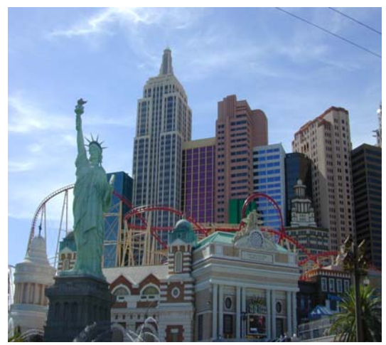
New York, New York Casino, Las Vegas, NV. BJY provided building safety services for this $400 million dollar project.

Arizona. The Firm works for the City of Phoenix and over 35 other jurisdictions performing Building Safety plan review, where we provide Structural, Fire and Life Safety, Accessibility, Energy Code, Plumbing, Mechanical and Electrical reviews on commercial and residential projects. Projects include office/warehouses, hotels, office buildings, shopping centers, manufacturing facilities, apartment complexes and single-family dwellings. We also provide CBO, plan review, building safety evaluation, and inspection services for the 2300 mW Panda Power Project, and the planned 845 mW Power